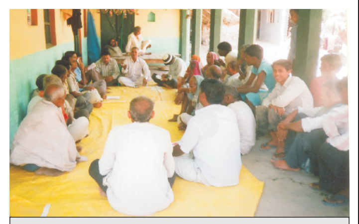
Meeting of Kisan club members

This programme has been initiated in April 2007 with 415 marginalized farmers in selected villages of Mithaval Block and the programme intended to promote good package of practices for safe, scientific, profitable and sustainable agriculture. It is directly benefiting the village