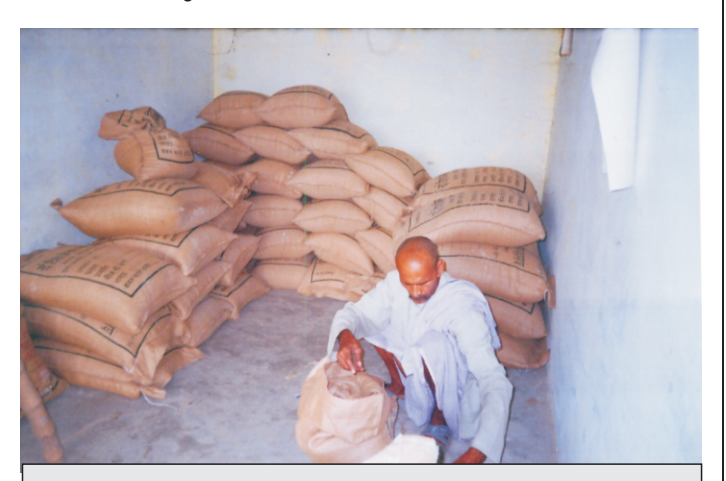
CFC Center, ASNAR

cultivation and implementation of the Package of Practices. The same model is replicated in five villages of Basti Sadar Block and we would like to mainstream this activity in all the programme areas of DISA. 14 Farmers Clubs have been adopted by NABARD for financial and technical support. We have also facilitated the production of PADDY and Wheat seeds for sale.