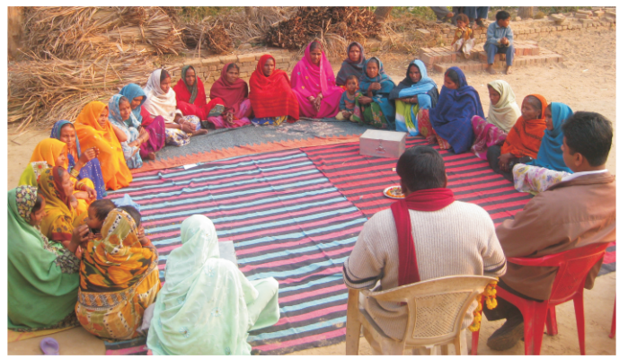
SHG Group Meeting at Vakaniya Deep

These Associations have become the platform for the women to come together, share their experiences, joys and sorrows, get some input and learning exercises, support each other and thus build the social capital for their empowerment and gender balance. They have undertaken many collective actions and organized common celebrations.